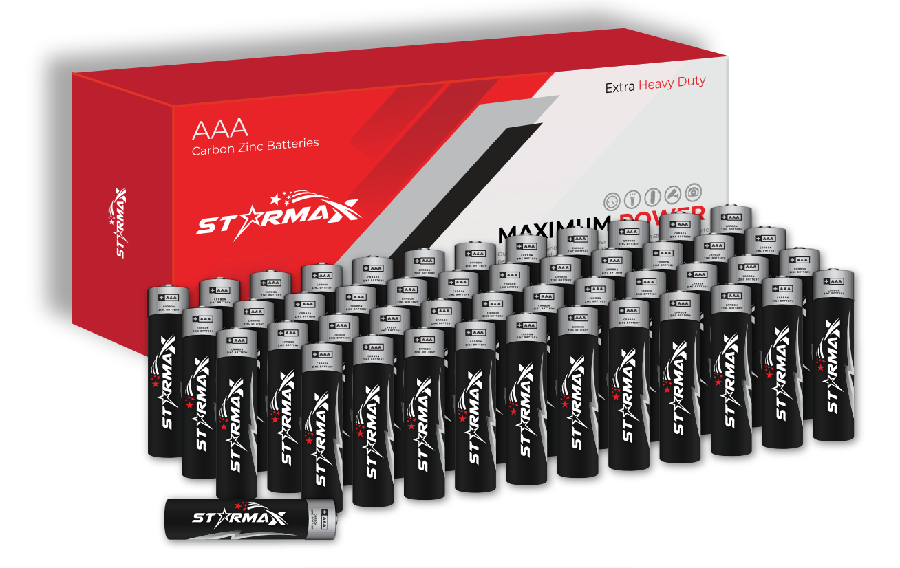
48 Batteries Per Box