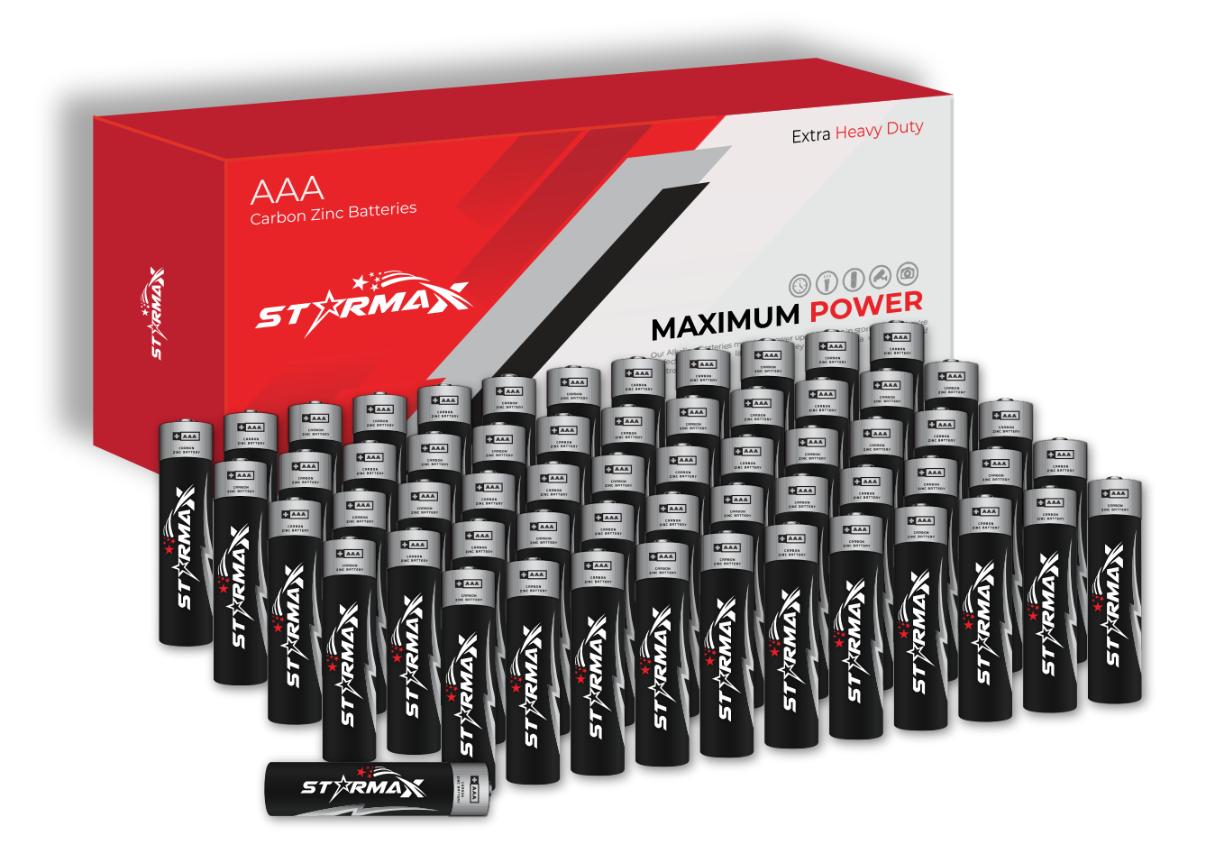
60 Batteries Per Carton