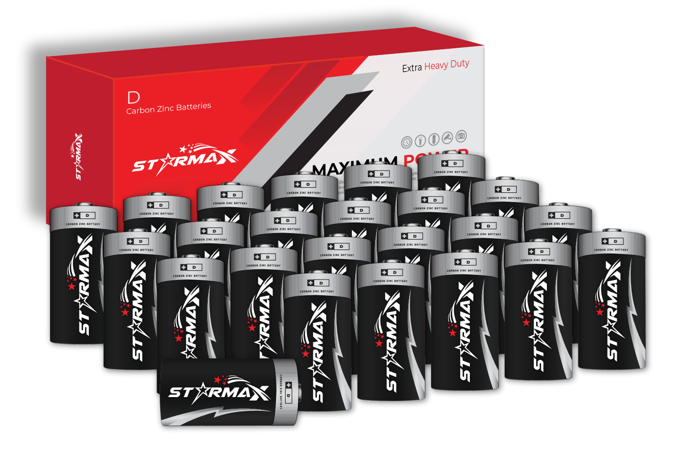
24 Batteries Per Box