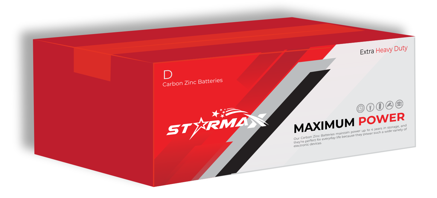
144 Batteries Per Carton